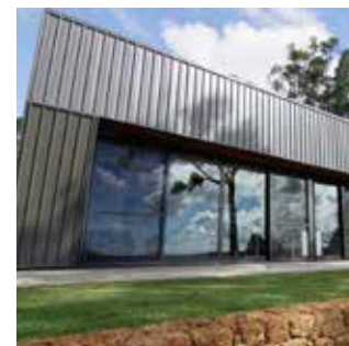
Architect: Joe Chindarsi, Chindarsi Architects