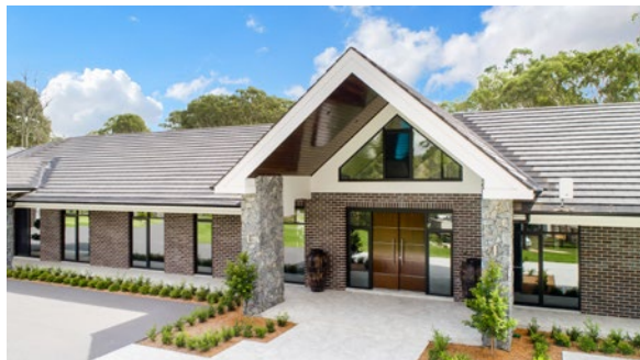
Architect: Fyffe Design Services. Builder: Gremmo Homes.