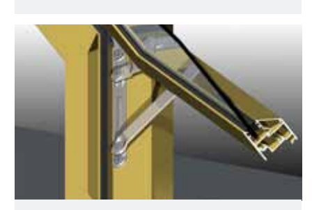
We offer a range of heavy duty sashes that can be fabricated in large sizes and are supported on heavy duty four bar friction stays.