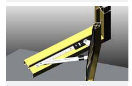
Elevate ^{\text{TM}} Commercial casements are supported on heavy duty four bar stainless steel stays.