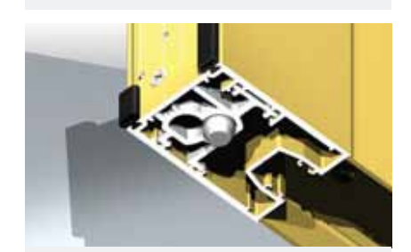
The stainless steel bolt tips are supported by extruded aluminium guides. This ensures the bolts fall in the right location and that they can withstand high wind loads when required.