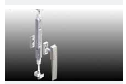
The bi-fold activator motor sits snugly in the frame and is positioned with nylon spacers again to ensure the bolts are in the right location in relation to head and sill.