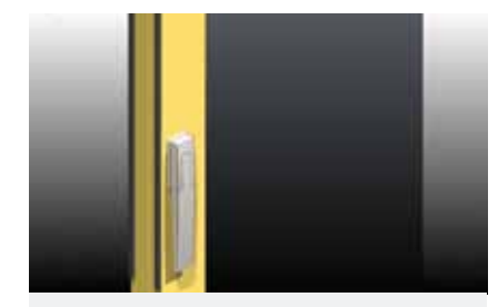
ICON ^{\text{TM}} bi-fold activator can be supplied non-key locking as shown above. The furniture is only available in 316 grade stainless steel.