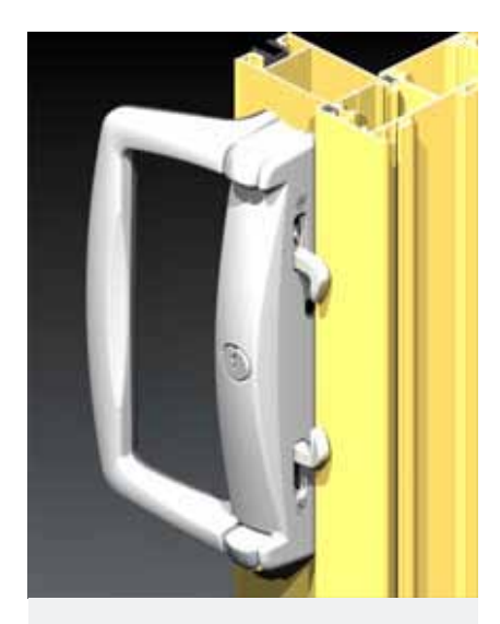
ANDO<sup>™</sup> Twin Point lock has twin locking stainless steel tongues that nest into matching adjustable keeper. Covers can be supplied powdercoat or 316 grade stainless steel.