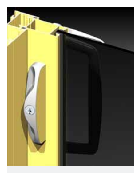
The outer pull on ANDO ^{\rm M} locks is powder coated over stainless steel. This significantly increases the strengths and weather resistance.