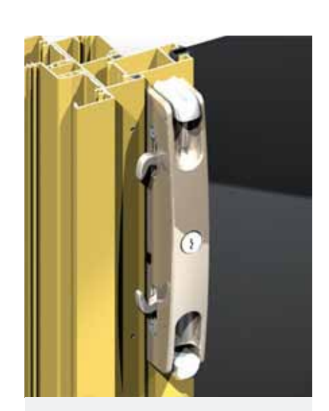
The twin locking stainless steel tongues nest into matching adjustable keeper.