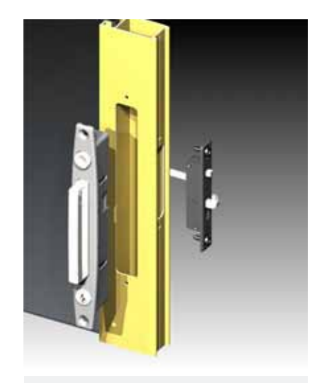
Mortice lock is securely fixed to window stile.