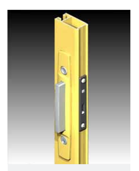
ANDO™ Sliding Window mortice lock is easily opened by depressing the push button. To lock depress the pull handle. Key lockable.