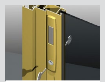
ALTERNATE COVER DESIGNS

Can be supplied in a range of standard and special powder coat finishes to match the window framing.