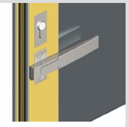
KEY LOCKING OPTION

ICON™ bi-fold activator can be supplied non-key locking. The furniture is only available in 316 grade stainless steel.