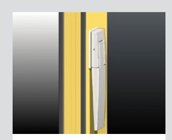
NON-KEY LOCKING OPTION

ICON™ bi-fold activator can be supplied non-key locking. The furniture is only available in 316 grade stainless steel.